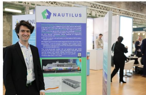
Figure 2: NAUTILUS at TRA 2024 Dublin