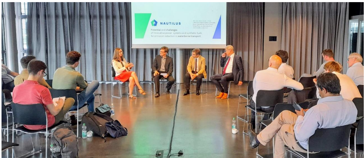
Figure 1: Workshop: Potential and challenges of innovative power systems and synthetic fuels for emission reduction in waterborne transport